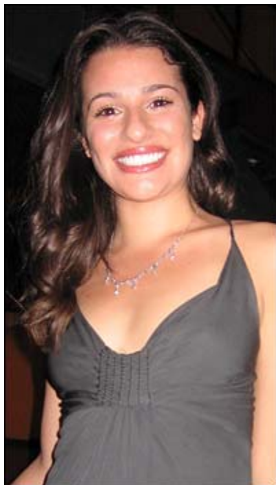
Lea Michele

Additional casting has been announced for musicals that will be showcased in staged readings in the National Alliance for Musical Theatre's 2007 Festival of New Musicals.